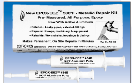
Easy to Use Dispenser Kits Save Time