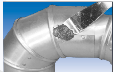
7032 Forms a 2000°F Seal For an Exhaust System