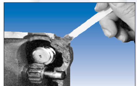
RK 454 Repairs Cast Iron Housing